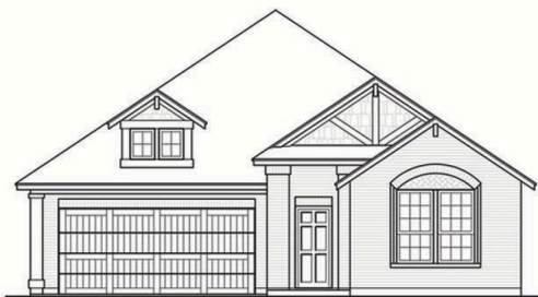
JACKSON - ELEVATION A