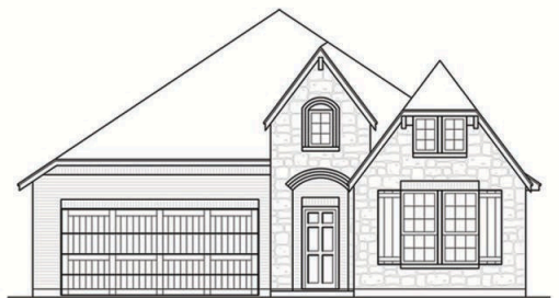
JACKSON - ELEVATION C