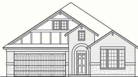
JACKSON - ELEVATION B